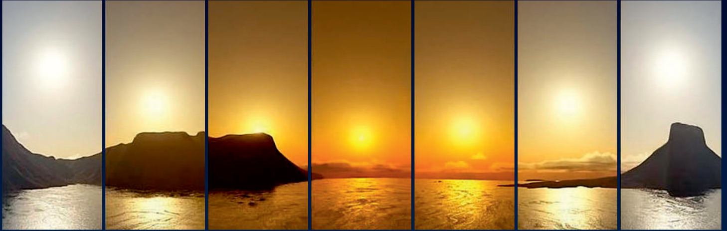
Configurable Biodynamic Smoothing